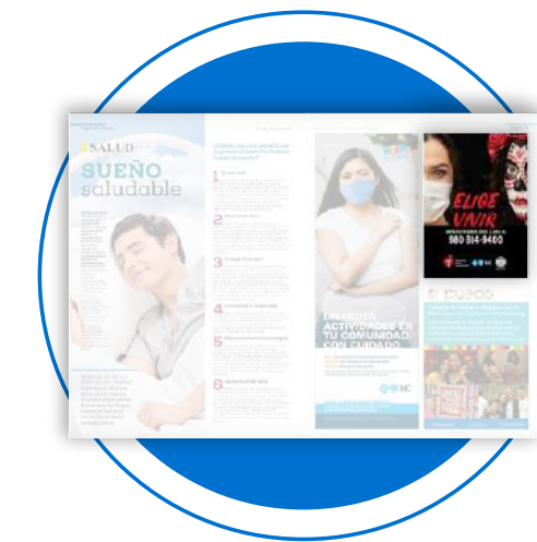
Vertical 1/4 Page 4.74" x 6.63"