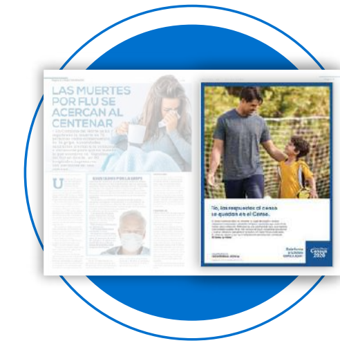
Full Page 9.75" x 13.5"