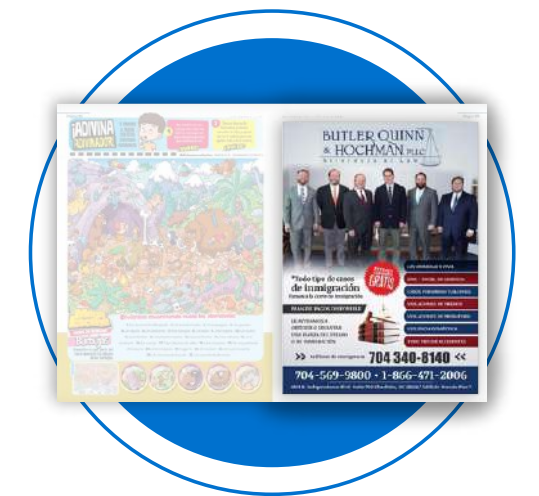
Inside Back Cover 9.75" x 13.5"