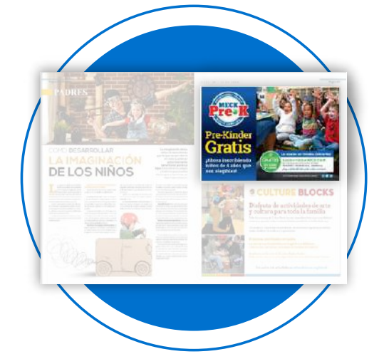
Horizontal Half Page 9.75" x 6.3"