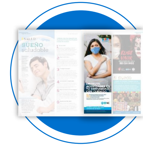
Vertical Half Page 4.74" x 13.5"