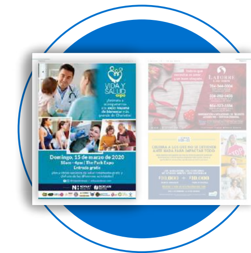
Inside Front Cover 9.75" x 13.5"