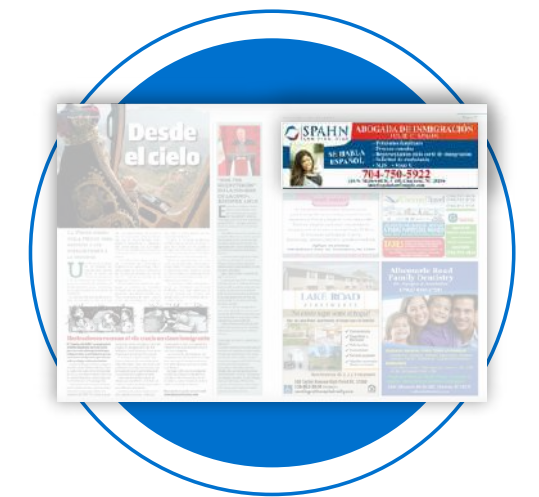
Horizontal 1/4 Page 9.75" x 2.3"