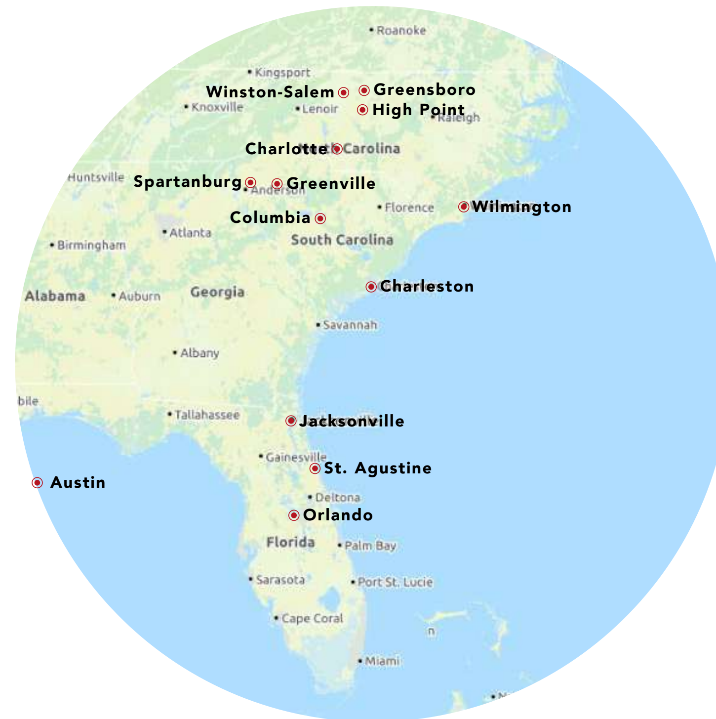
HOLA NEWS CIRCULATION MAP

24,000 copies distributed. 4.5 Readers per copy totaling 108,000 Impressions