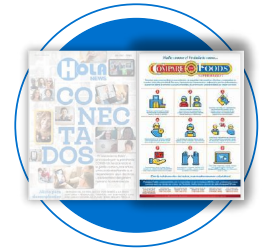
Back Cover 9.75" x 13.5"